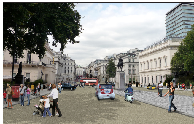
Artist's impression of Waterloo Place