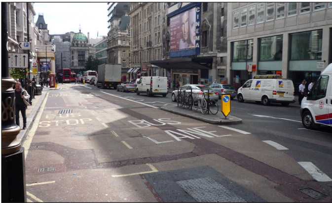
Existing photograph of Haymarket looking south