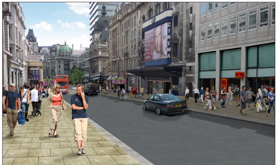
Artist's impression of Haymarket looking south

The artist's impression in this leaflet give an indication of how local environments will be improved including widened footways, reduced street clutter and new carriageways surfacing on Haymarket, lower Regent Street and Waterloo Place.