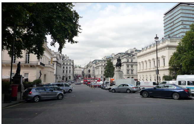
Existing photograph of Waterloo Place