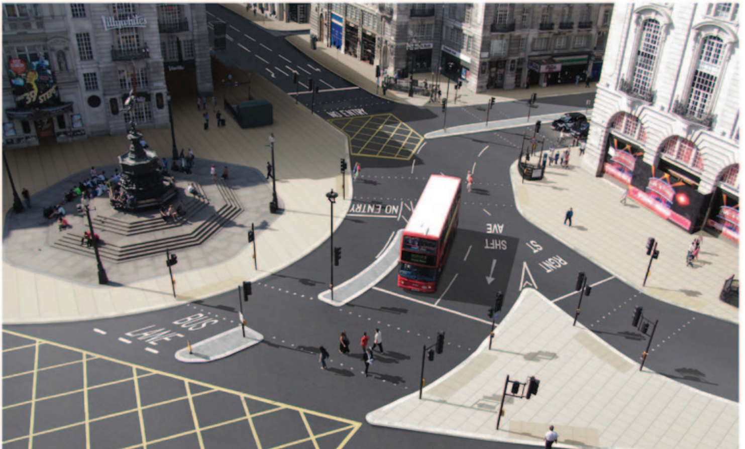
Artist's impression of Piccadilly Circus

The artist's impressions in this leaflet give an indication of how local environments will be improved and what the improved pavements and changes to street furnishings will look like. The central islands will house new 10m tall Grey Wornum lamp columns which will be combined with traffic signals and road signs to reduce street clutter.