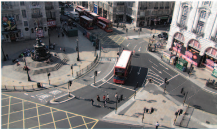
Existing photo of Piccadilly Circus