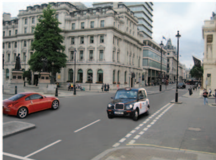
Artist's impression of Waterloo Place