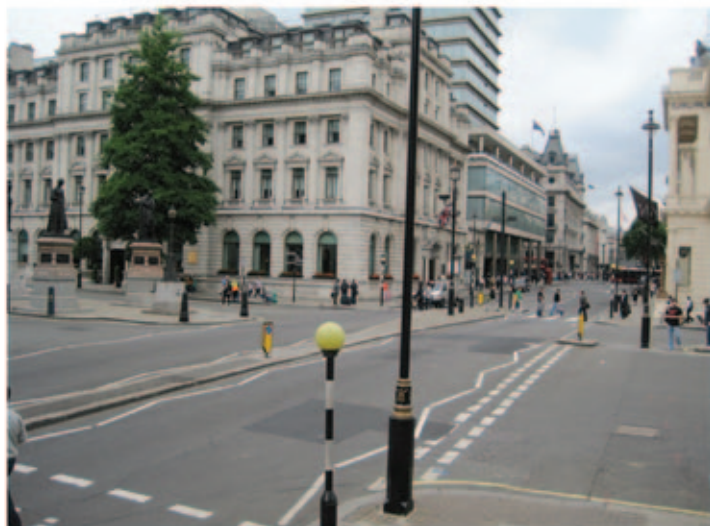
Existing photo of Waterloo Place